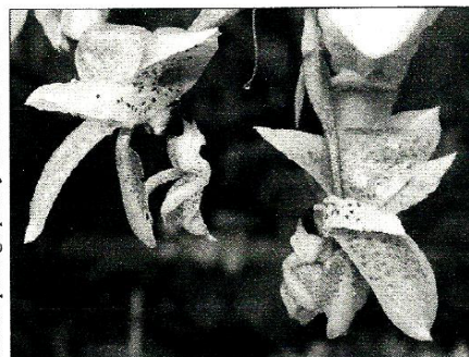
Stanhopea wardii , Ward's stanhopea