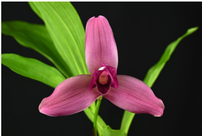
Lycaste Reina Del Cisne 'Nikole' AM | AOS (80 points) Lycaste angelae x Lycaste Kiama

LOOK on the AOS website to find the most recently awarded orchids! Exhibits are also included in the latest awards gallery. Check it out to get some great ideas for your next display. https://secure.aos.org/orchid-awards.aspx