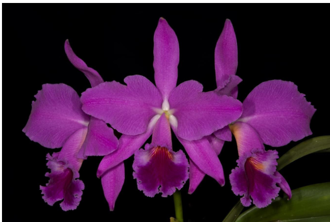
Cattleya jenmanii 'Terez' HCC | AOS (79 points)