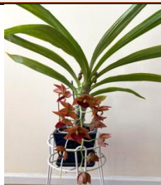
Cycd. Taiwan Gold 'Orange' Marilyn Lauffer

4 Exhibitors, 5 Plants, 12 Zoom Attendees submitted by Mai Conaway