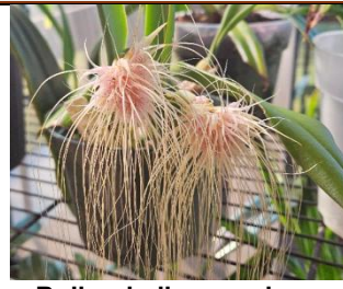
Bulbophyllum medusae Mai Conaway