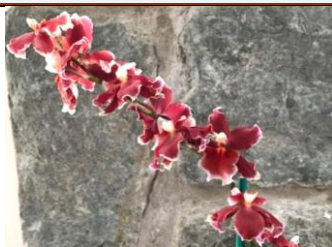
Oip. Crimson Pride 'MAC 136' Monica Sparber