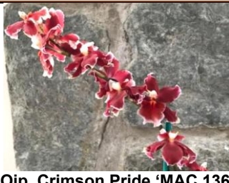
Oip. Crimson Pride 'MAC 136' Monica Sparber