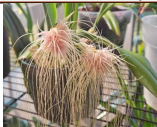
Bulbophyllum medusae Mai Conaway