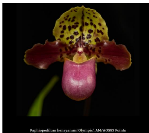
Paphiopedilum henryanum 'Olympic', AM/AOS82 Points