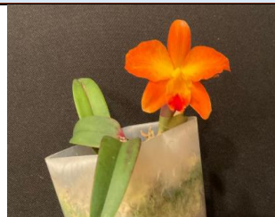
Slc Seagull's Apricot x Slc 'Harford's Elmwood' 4N AM/AOS Suzanne Gaertner